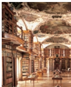
Museums, art galleries

The HygroPalm2-series (with integrated or interchangeable probes) is ideal for all applications where exact measurement of humidity and temperature is of decisive importance, e.g. the food and pharmaceutical industries, printing and paper industries, many trades, the sciences, meteorology, agricultural sector, climatology, etc. There is hardly a field today in which these parameters may be ignored. It is ultimately the measuring task at hand that defines the HygroPalm instrument that best meets your needs.