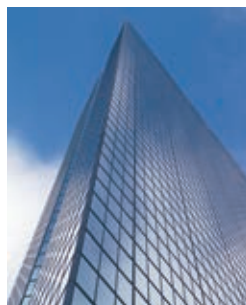
HVAC / Building management