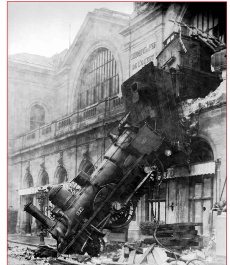
Small errors can lead to big failures.

Instrument performance is determined by all the elements of the chain and not by the sensor alone. The sensor and associated electronics cannot be considered separately. Any factor that can disturb the chain process of measurement is bound to have an effect on instrument performance.