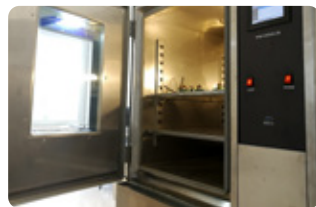
Climatic chambers /fridges