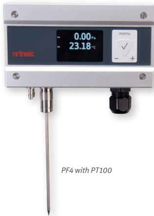
PF4 with PT100