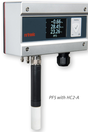
PF5 with HC2-A