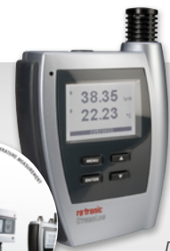
Data logger HL-NT

We offer an upgrade to the Rotronic Monitoring System (RMS): Keep the same hardware* and move forward to the new generation of Environmental Monitoring Systems.