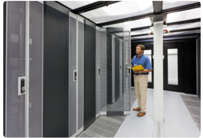
Indirect adiabatic cooling ensures highly efficient cooling to server racks.

Ultimately, improved efficiency and reliability ensures Colt Data Centre Services is providing the most environmentally friendly solution. Previously Colt demonstrated 18% energy reduction through simple improvements to data centre efficiency.