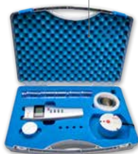
HygroGen2-XL Humidity calibrator