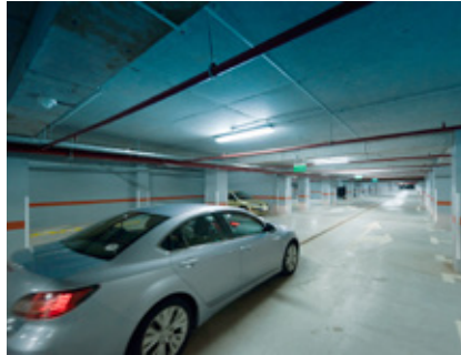
Monitoring in underground garages (safety)