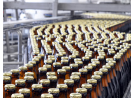
Leak monitoring in filling plants (safety)