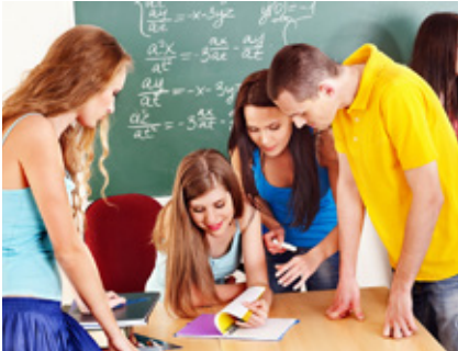
Indoor air quality