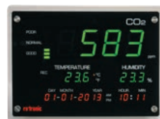
CO 2 -Display