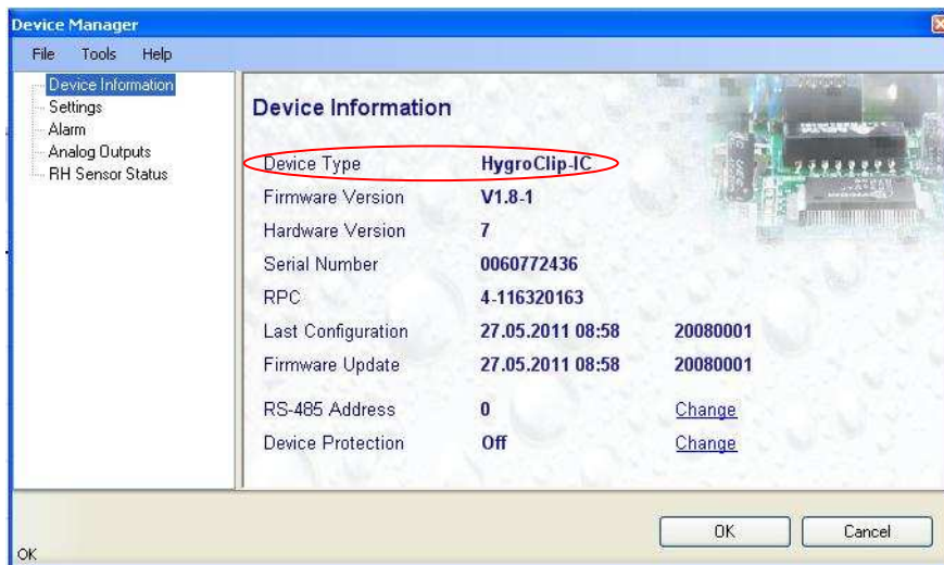
Picture 1: HEX file shall have the same naming as “device type”. In this case the name of the HEX file shall be HygroClip-IC.HEX

Download the .ZIP file corresponding with the device type of your AirChip3000 device from the ROTRONIC website. Unzip the file and save it in the SYS subdirectory of your ROTRONIC_HW4 user folder. Make sure that “device type” and the name of your HEX file are the same. (See picture 1 below) Rename the hex file if necessary to the “device type” shown in Device Manager.